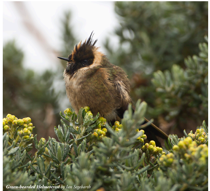
Green-bearded Helmetcrest by Ian Segebarth

Rates are based on double occupancy for participants. A $200 per person deposit and enrollment form is due to secure your reservation. This deposit is refundable until 95 days prior to departure excluding a $100 cancellation fee. Final payments are due no later than 95 days prior to departure. Non-refundable final payment is due at 95 days prior to departure.