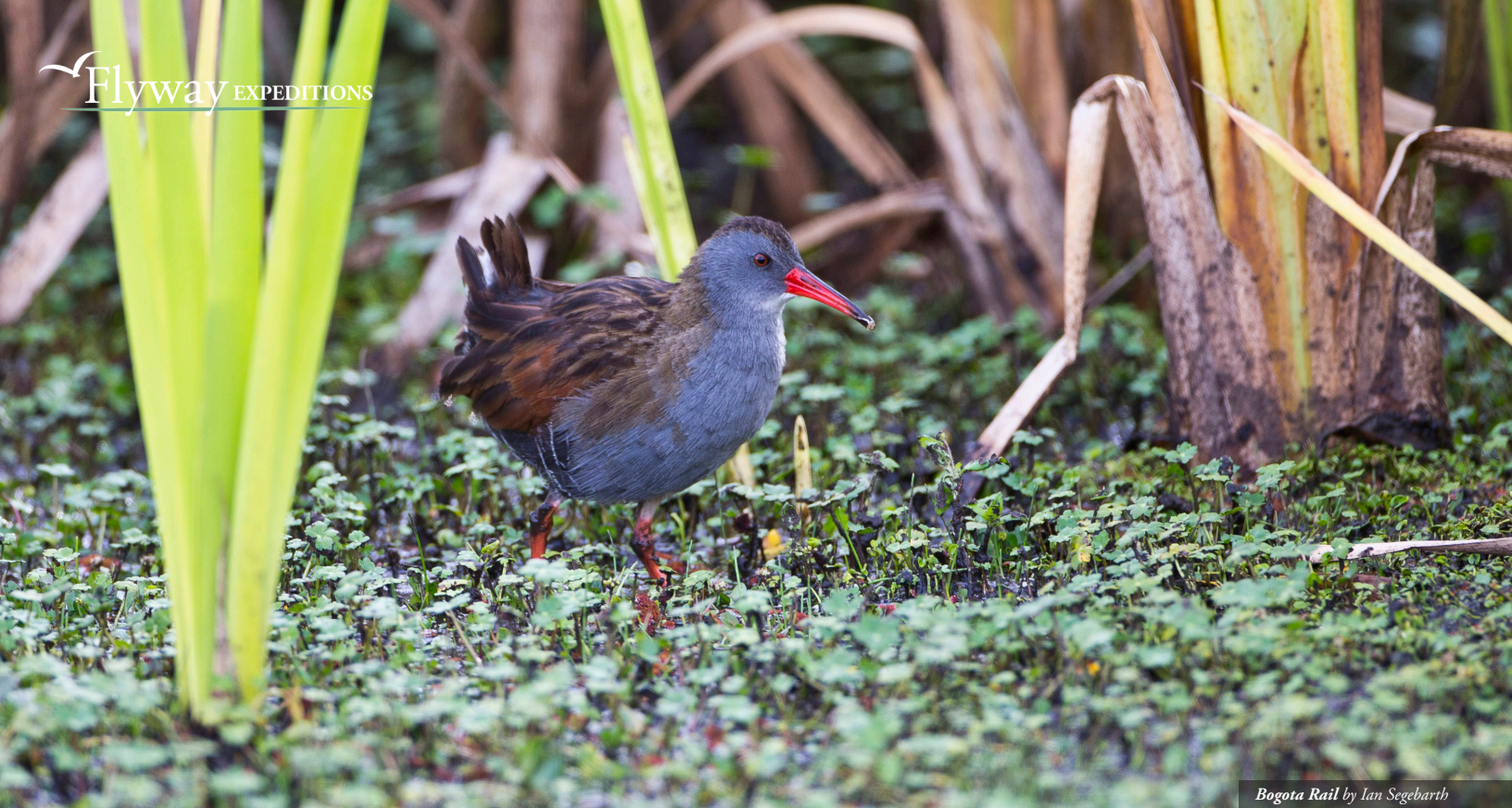
Bogota Rail by Ian Segebarth