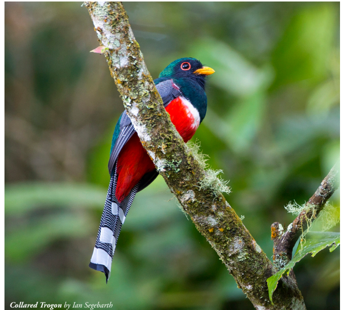
Collared Trogon by Ian Segebarth