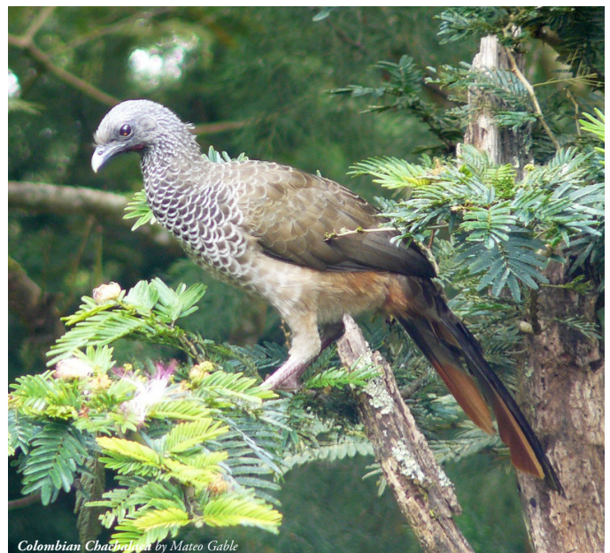
Colombian Chachalaca by Mateo Gable