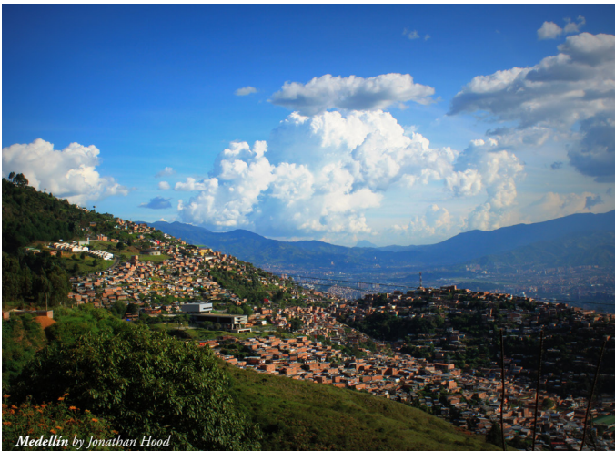
Medellín